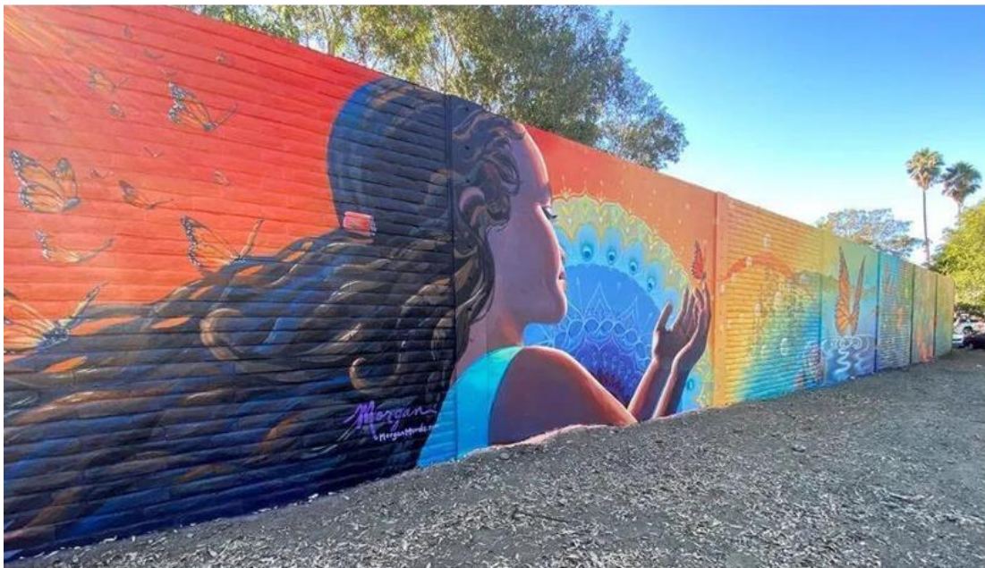
Figure 2 features El Sueño De La Mariposa (“The Dream of the Butterfly”) by Morgan Bricca. The mural is located at Havana Drive and Midfield Avenue in San José.

As Arturo describes, murals that show knowledge of localized shared experiences and challenges can help surrounding communities feel less alone. The community identifies with visual stories that are both from and for the surrounding community. Meanwhile, polished murals found on main streets, as Arturo describes, can feel as if artists created them for audiences that exist outside of the immediate community residents. In this sense, murals have the power to promote either inclusion or isolation based on how artists place them (Ballinger 2021, 90-101).