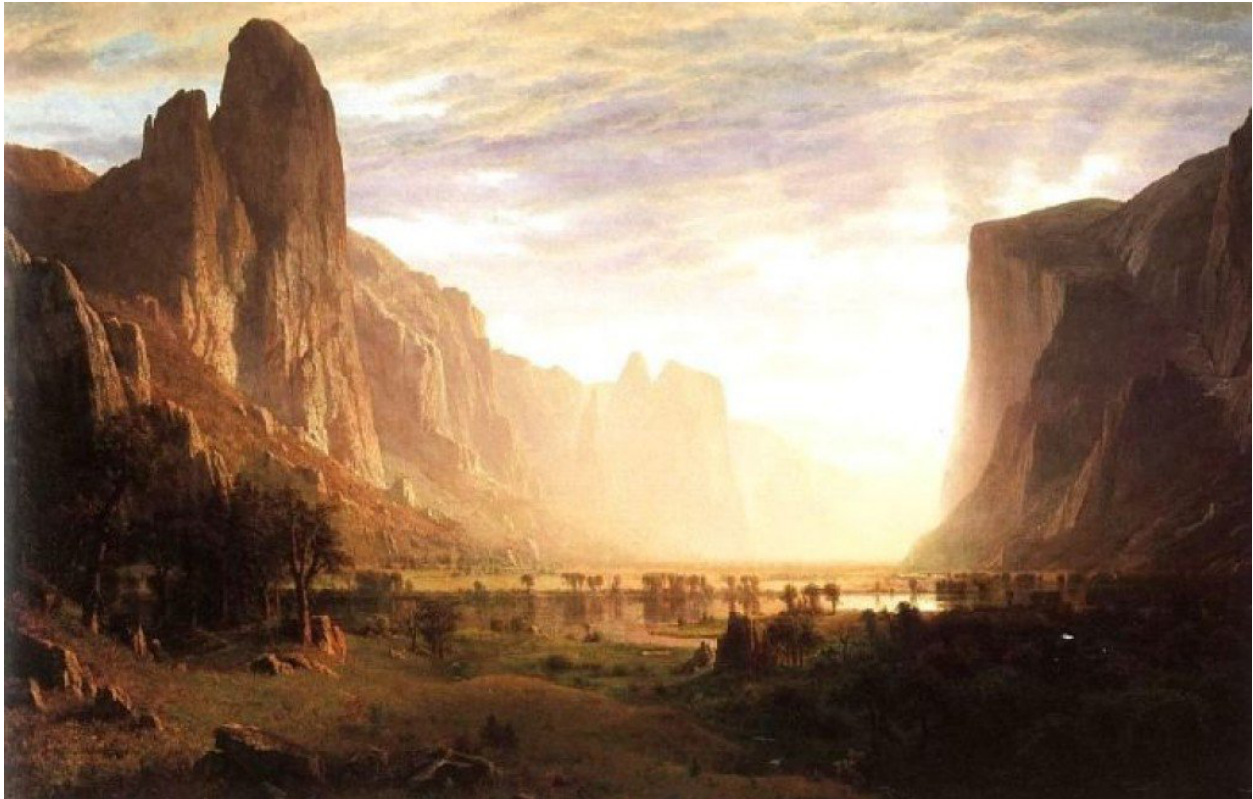
Alfred Bierstadt, “Looking Down Yosemite Valley, California”

This course of first-year writing is an introduction to academic rhetorical analysis and writing skills through an exploration of unique and varying perspectives on American literary renaissances. “Renaissance” means a rebirth—a reawakening. How do we define and understand this in context to American literary culture? How can we ascertain and determine periods of American Renaissance? Moreover, what can we learn from studying them? This class explores the intellectual and cultural revolutions that have occurred in American literature since its foundation. By voyaging through canonical and non-canonical texts by notable authors such as Emerson, Thoreau, Poe, Whitman, Dickinson, Frost, Stevens, Eliot, Roethke, Sexton, and Plath, students will gain a comprehensive understanding of the inception and evolution of high art and philosophy that has shaped the creation and definition of American identity.