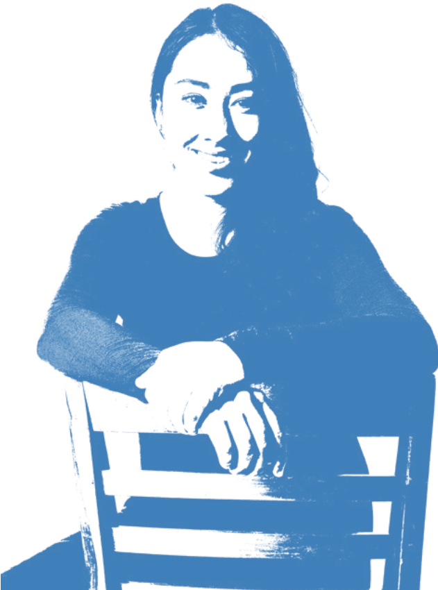
Maria Communication Studies

For more information, visit sjsu.edu/faso/types-of-aid/scholarships/index.php