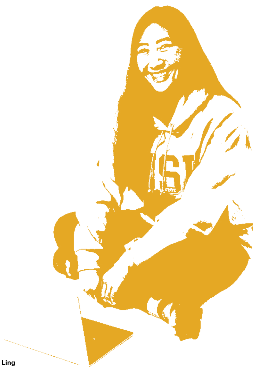
Ling BA Behavioral Science

Monitor your MySJSU account frequently for financial aid status changes and outstanding "To Do List" items.