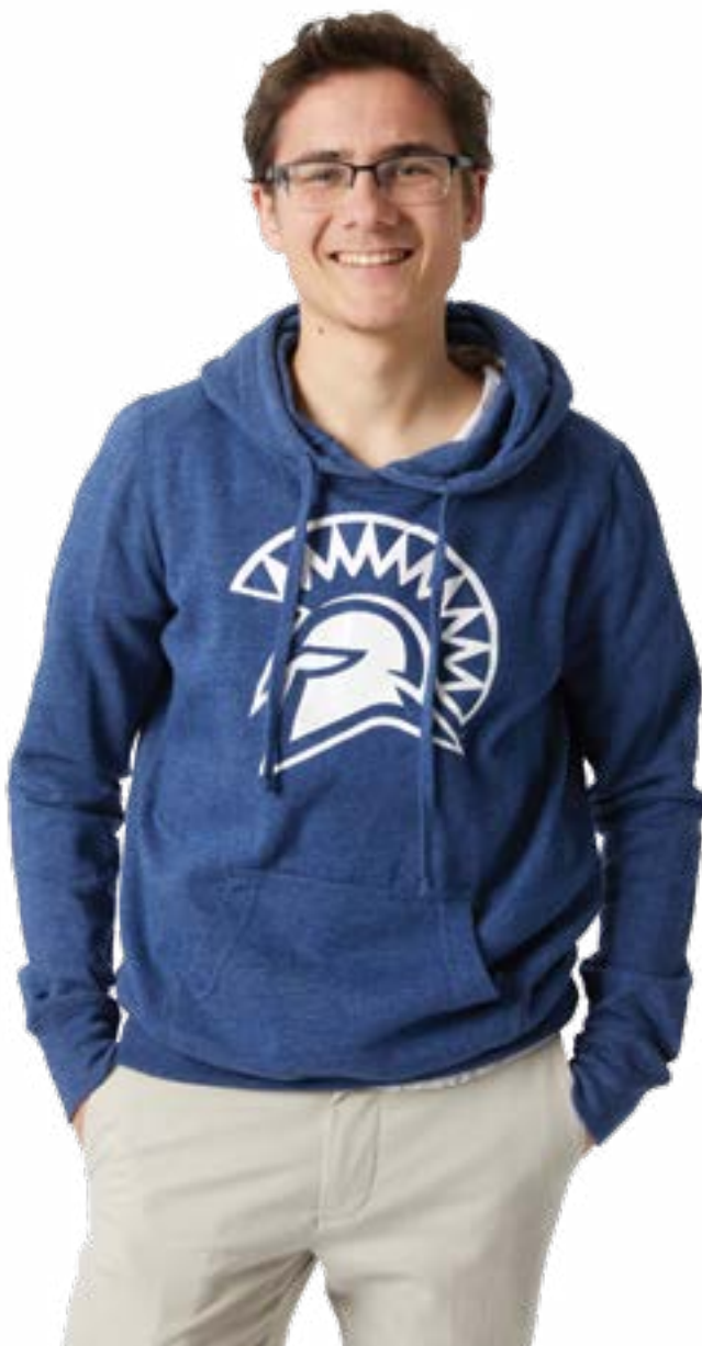
Nikola Biological Science/ Systems Physiology

Pay your enrollment deposit at nextsteps.sjsu.edu