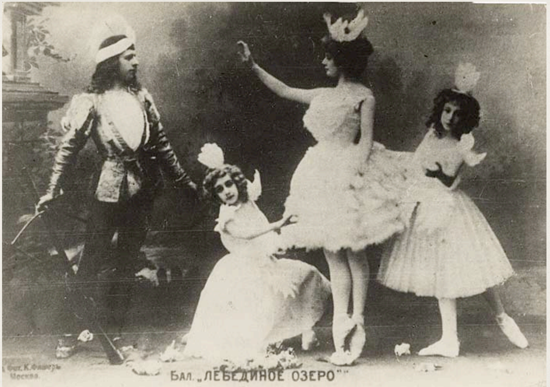
Dancers from the original production of Swan Lake