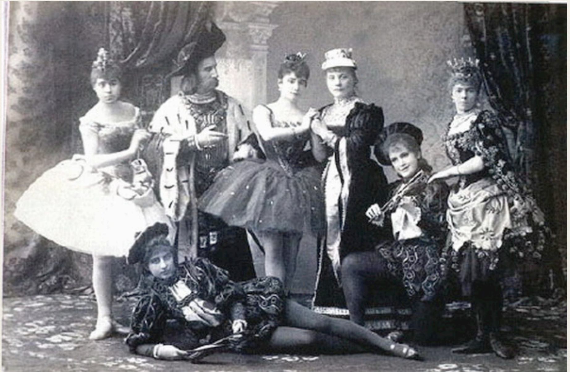
Dancers from the original production of Sleeping Beauty