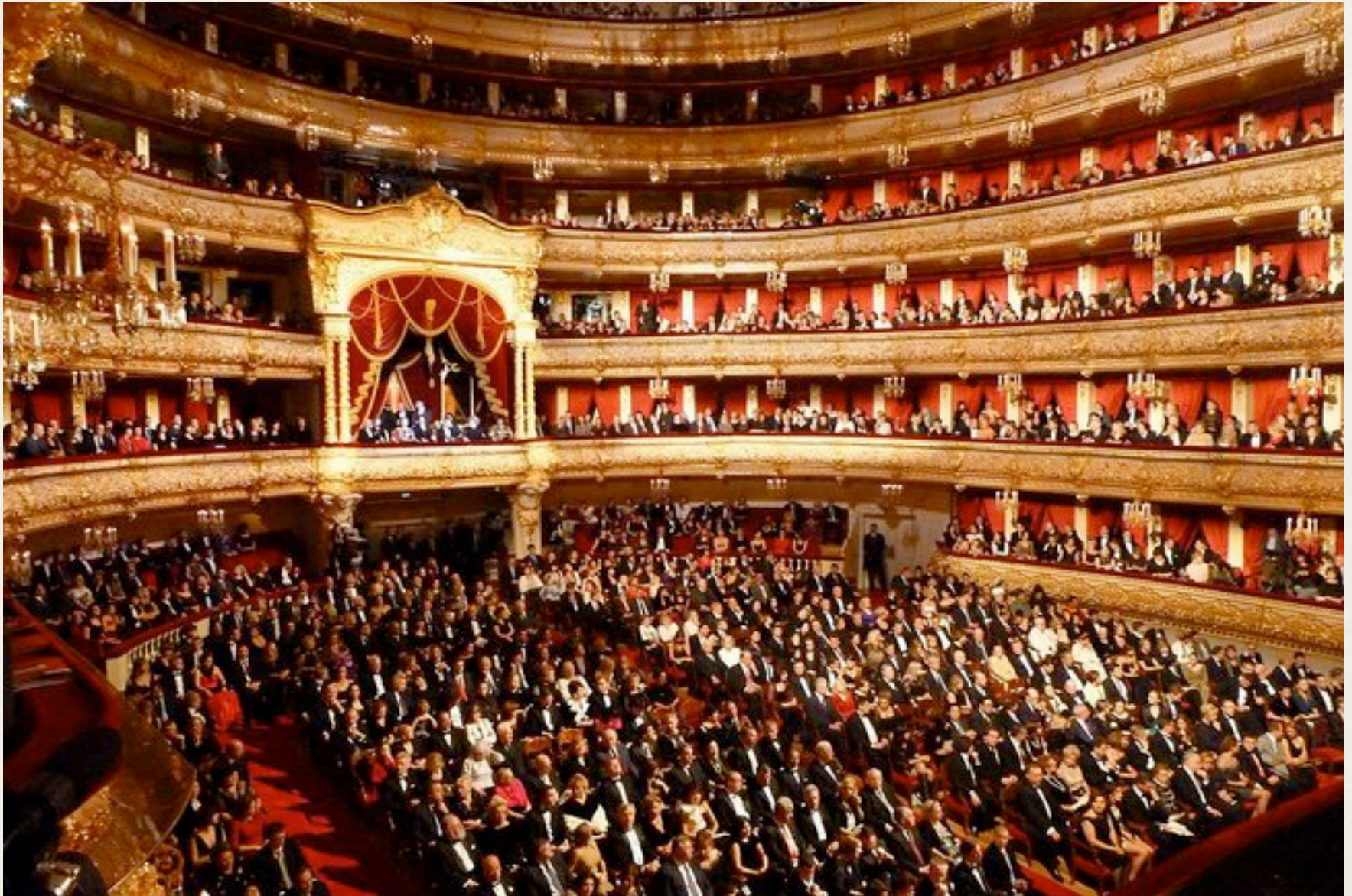
Interior of the Bolshoi Theatre