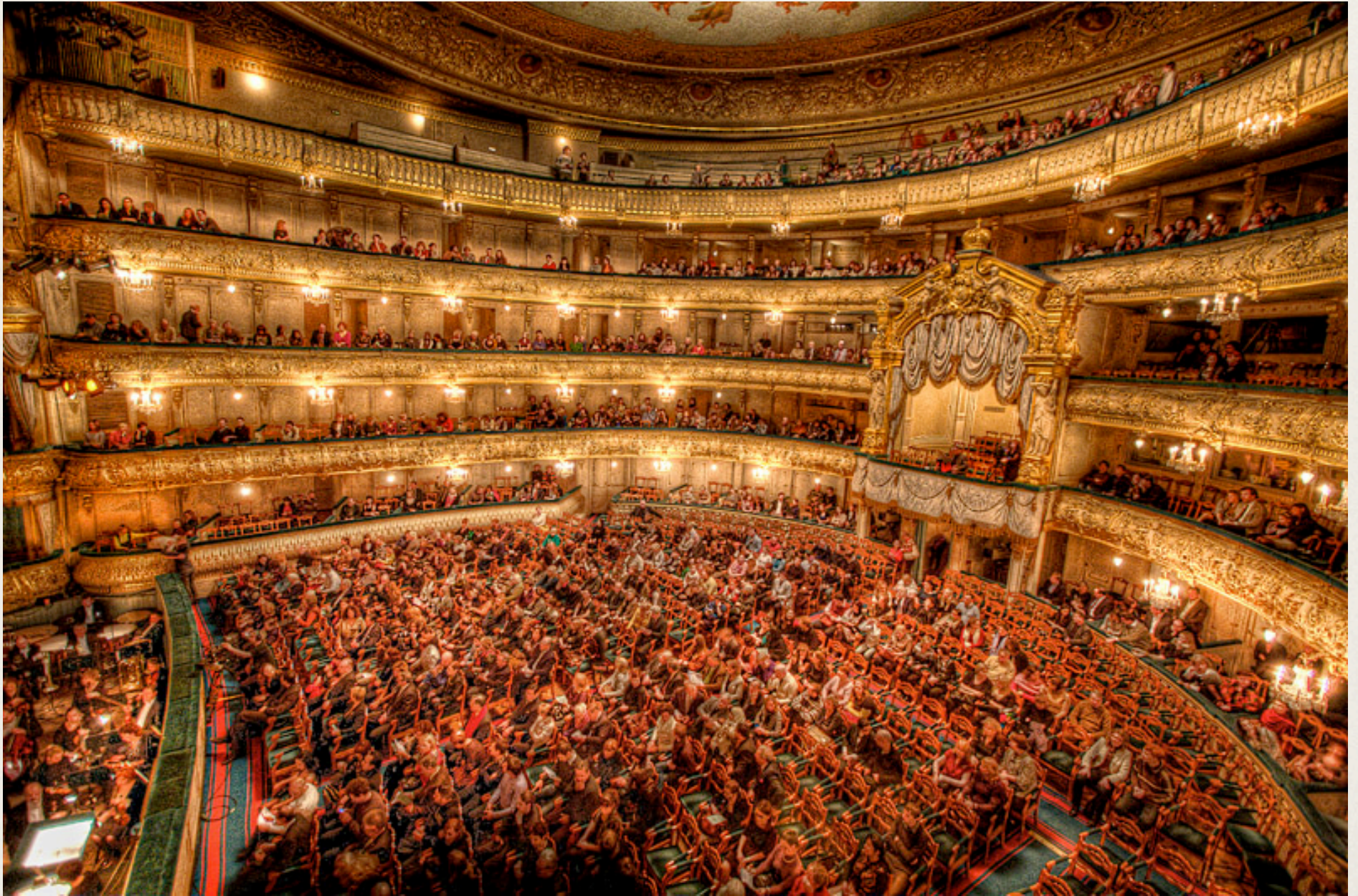
Interior of the Mariinsky Theatre