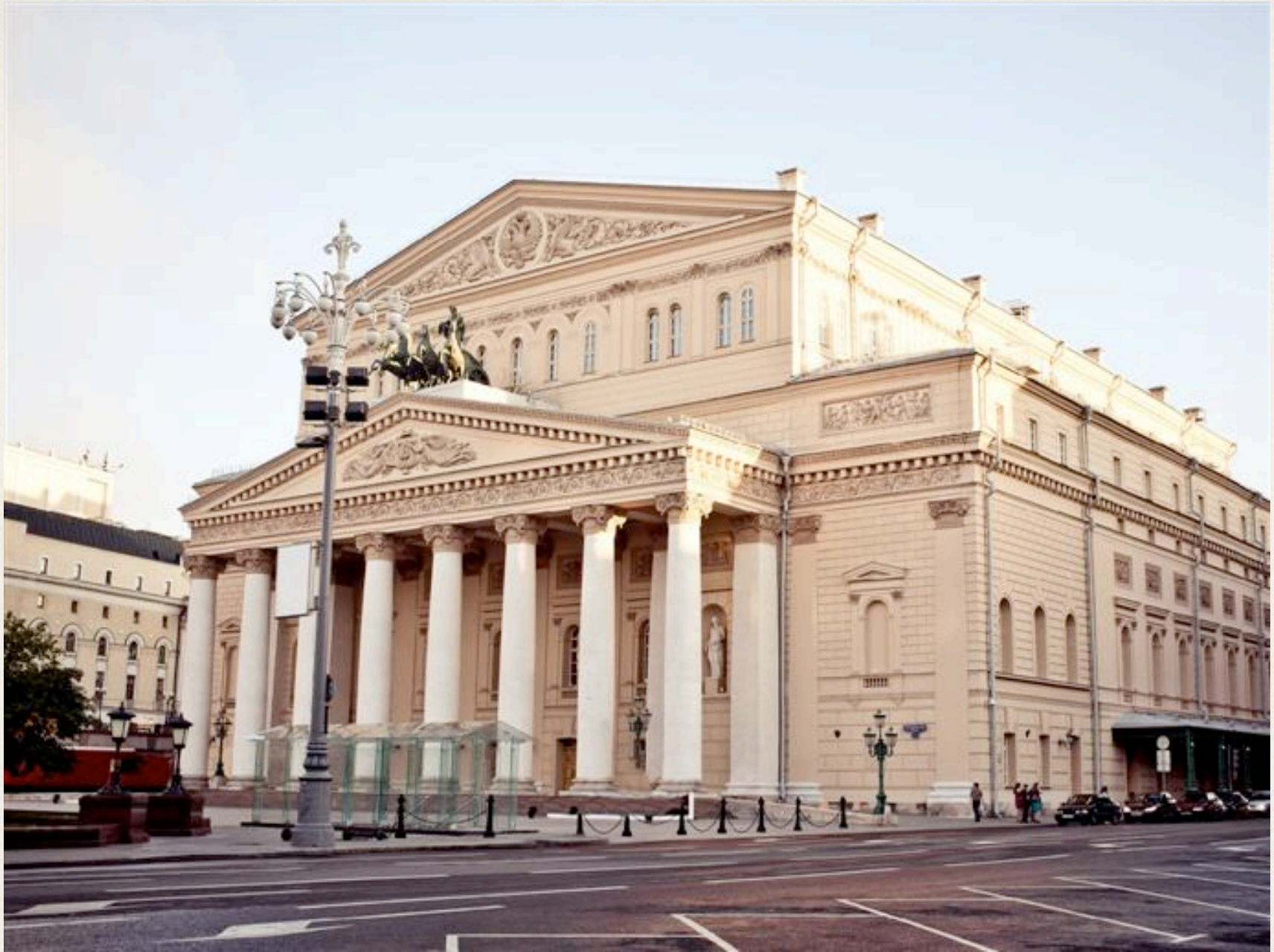
The Bolshoi Theatre, Moscow