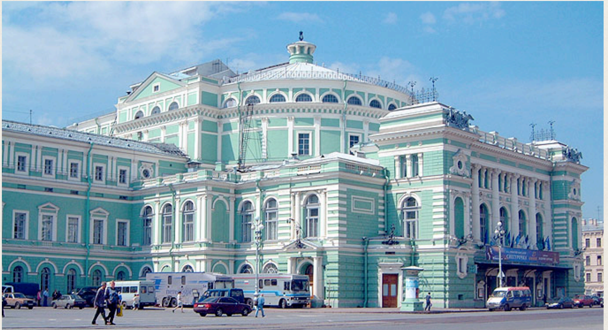
The Mariinsky Theatre, St. Petersburg