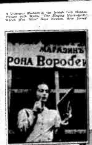
A Ukrainian Model in the Jewish Film "Yankl" (left) and the Russian Actress in the scene "The Day of the Execution" in the Motion Picture Version of "Yankl" (right)