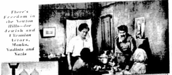
There's Freedom in the Western Hills—for Jewish and Russian Artists, Models, Musicians and Actors